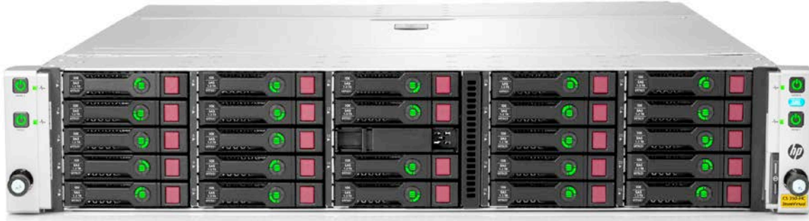
Chassis, front view with 24 drives