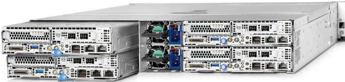
Chassis, back view with 4 nodes